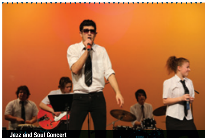
Jazz and Soul Concert